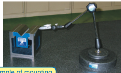
An example of mounting

2 stage circular shaped bases, is easily handled by hands.